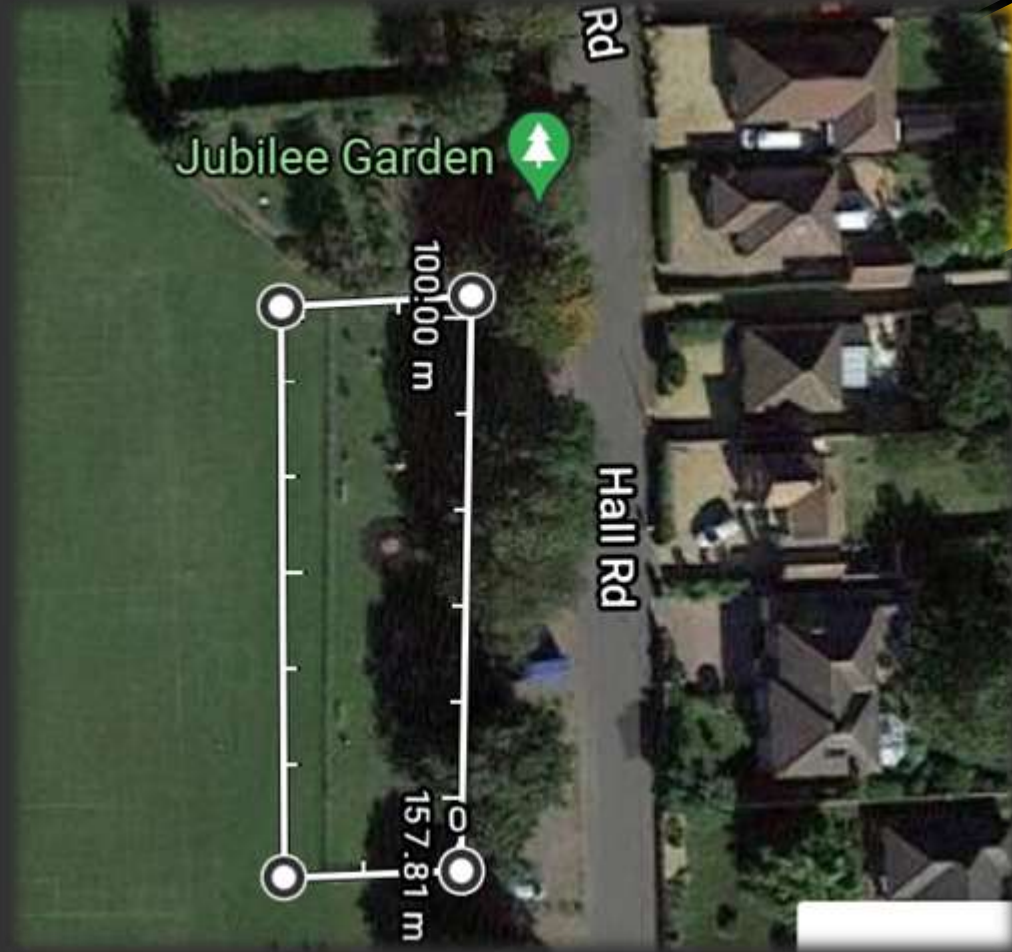
Google Earth Shot of Site Boundary