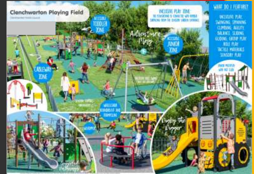
Clenchwarton Play Area Renovation